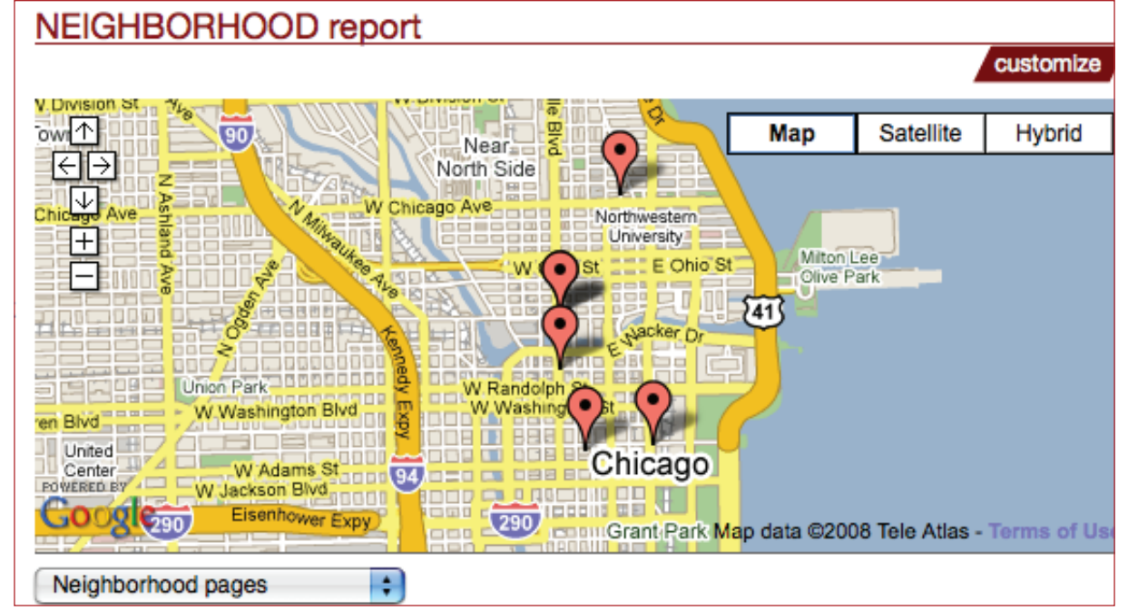
News items can be displayed on a map of each user's neighborhood.

The Daily News home page has a map that centers on a user's neighborhood and displays map pins that indicate the